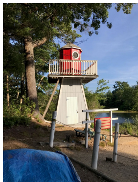
Left: Almost completed Water Front Tower